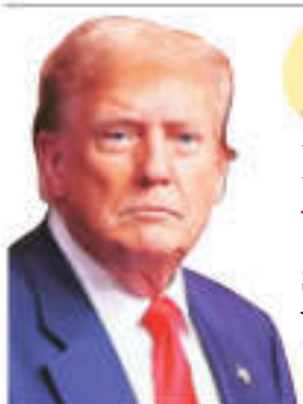
DONALD TRUMP, PRESIDENT, US

After the fight wiped a record $153 billion from the market value of the electric carmaker on Thursday and dragged down broader indexes, it became clear how much Musk had to lose. And he blinked, pulling back from a threat to idle SpaceX's astronaut-carrying vehicle and