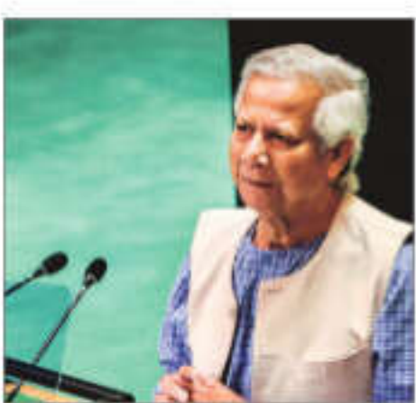
Bangladesh's interim leader Muhammad Yunus

Yunus took over three days after former PM Sheikh Hasina was ousted in a student-led mass uprising in August 2024, ending her 15-year rule. Hasina has been in exile in India since. The interim government banned Hasina's Awami League party, which is one of the country's two largest political parties. Hasina faces trial for hundreds of deaths related to the