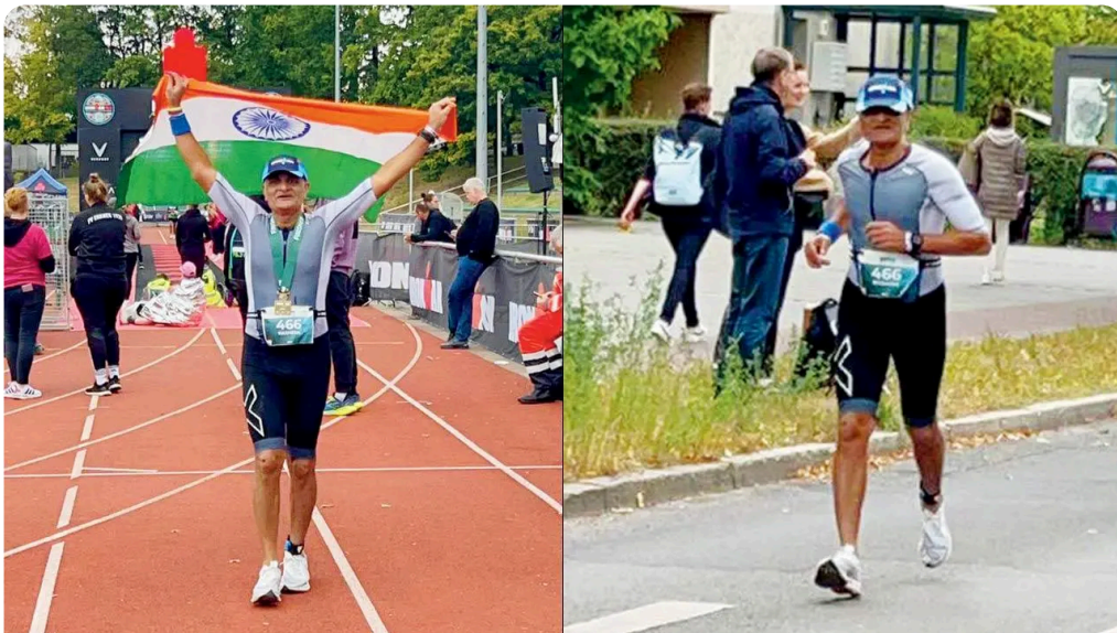
The finisher flies the tricolour; (right) Hitting his stride in the running leg