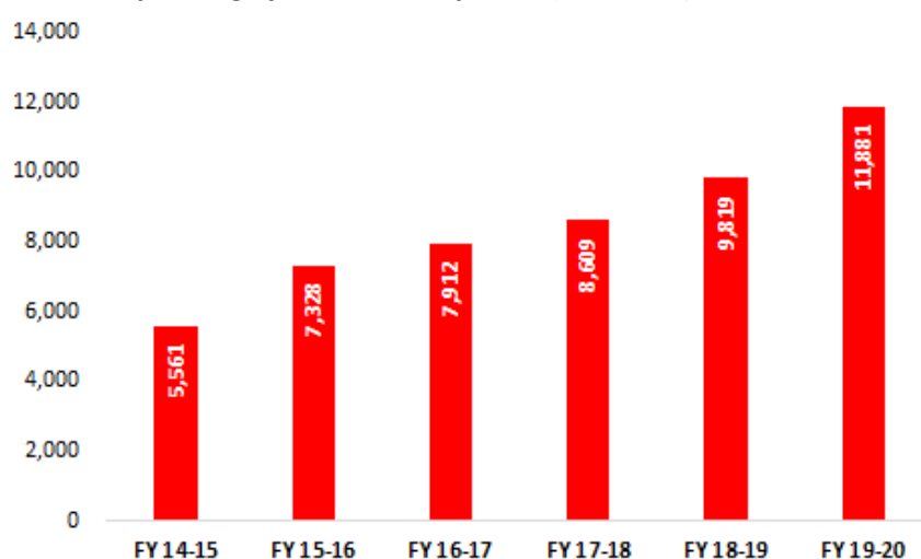
Chart 15: CSR spending of BSE 200 companies (INR crore)